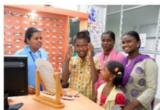
Optical Dispensing by VC Co-ordinator