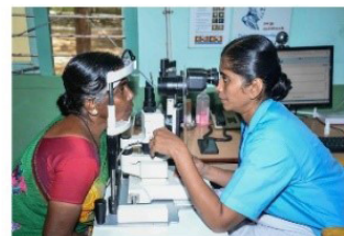
Slit lamp and IOP test by Vision Technician