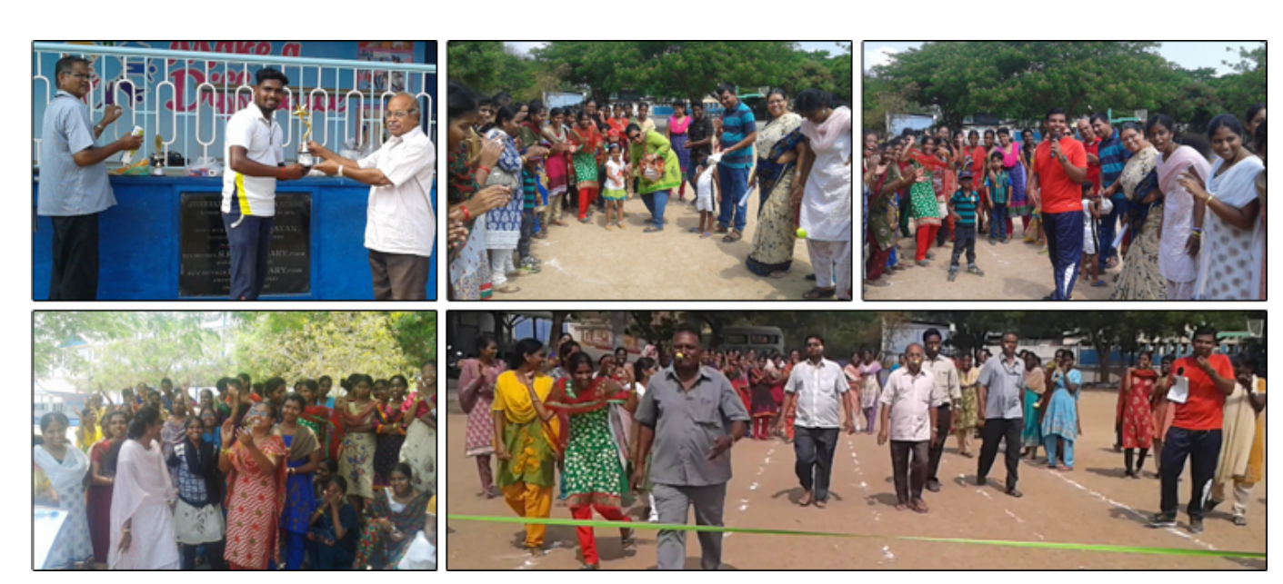
Aravind – Salem organized track events, outdoor games and few team building sessions for the employees. Staff including all cadres was divided into two teams named Miraclers and Battlers. All the employees enthusiastically took