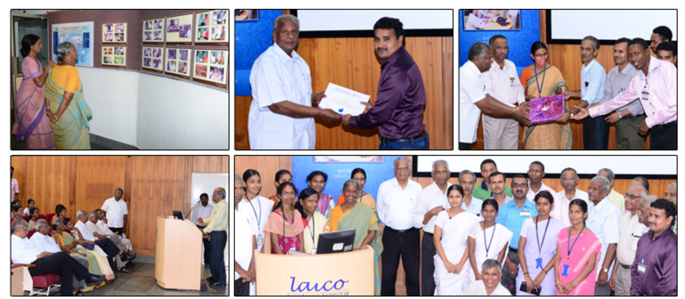
senior members and staff of Aravind. Trainees were given certificates and tools kit at the end of the programme.