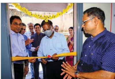
Madhavaram (March 31, 2022)