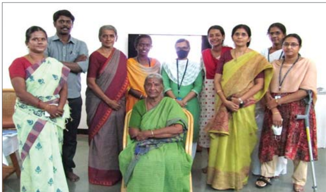
Launch of AuroOli and the team behind it

A campaign to commemorate Aurovue IOLs crossing one million implants worldwide was conducted successfully. Until last year, Aurolab was selling this product through distributors and it did not have any direct connection with ophthalmologists who actually use the product. Hence as part of the campaign, a website, www.aurovue.com was developed to offer a platform for doctors to interact directly with the