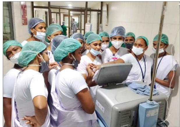
Operation theatre nurses learning about vitrectomy machine at the workshop

The workshop was organised for operation theatre nurses to brief them on the importance of anterior