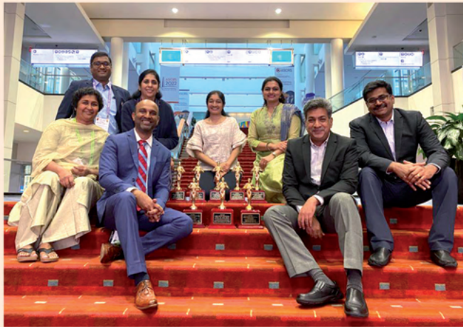
Aravind team with the ASCRS Film Festival Awards