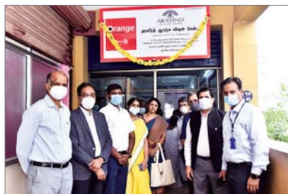
Sholavaram (July 22, 2021)