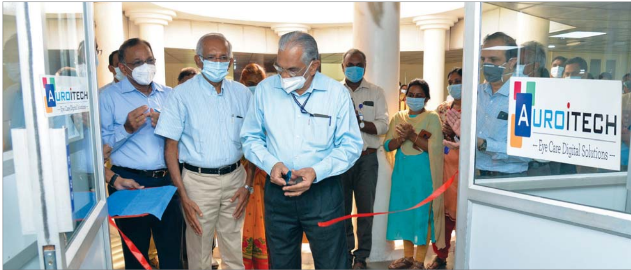
Inauguration of the new office of AuroiTech

and started sharing its products and solutions with other eye care providers. As the scale of activities and the staff increased, the IT department got its own identity as AuroiTech and it continues to develop and provide innovative eye care solutions and help keep Aravind at par with the global, technological world. As the gamut of eye care solutions that AuroiTech offers widened and the growing number of its external clients necessitated the department to enhance its capacity - staff competency and infrastructure. This long-felt need for a central office to manage the diverse IT operations got realised in January 2021 with the opening of a new facility on the third floor of LAICO building for AuroiTech.