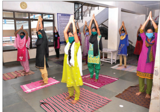
MLOP well-being programme at Aravind - Tirunelveli

More than 80% of Aravind's workforce are young women from surrounding villages - they deal with