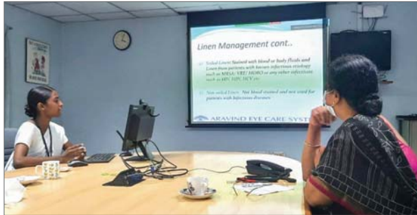
CME on CSSD, Aravind - Coimbatore