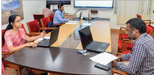
The MSICS way, Aravind-Madurai