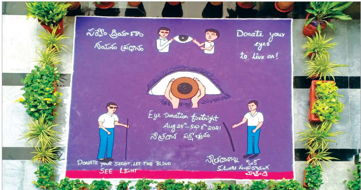
Special 'kolam' to observe Eye Donation Fortnight, Aravind-Tirupati