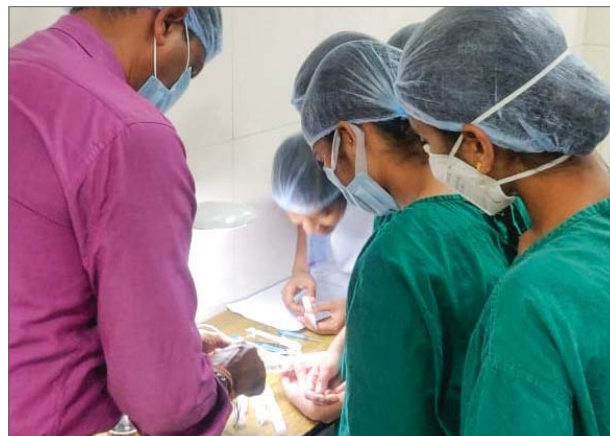
Hands-on training at IOL loading workshop

Cataract and IOL Services, Aravind-Madurai conducted a workshop for operation theatre allied ophthalmic personnel to improve their IOL loading skills. A total of 63 participants took part.