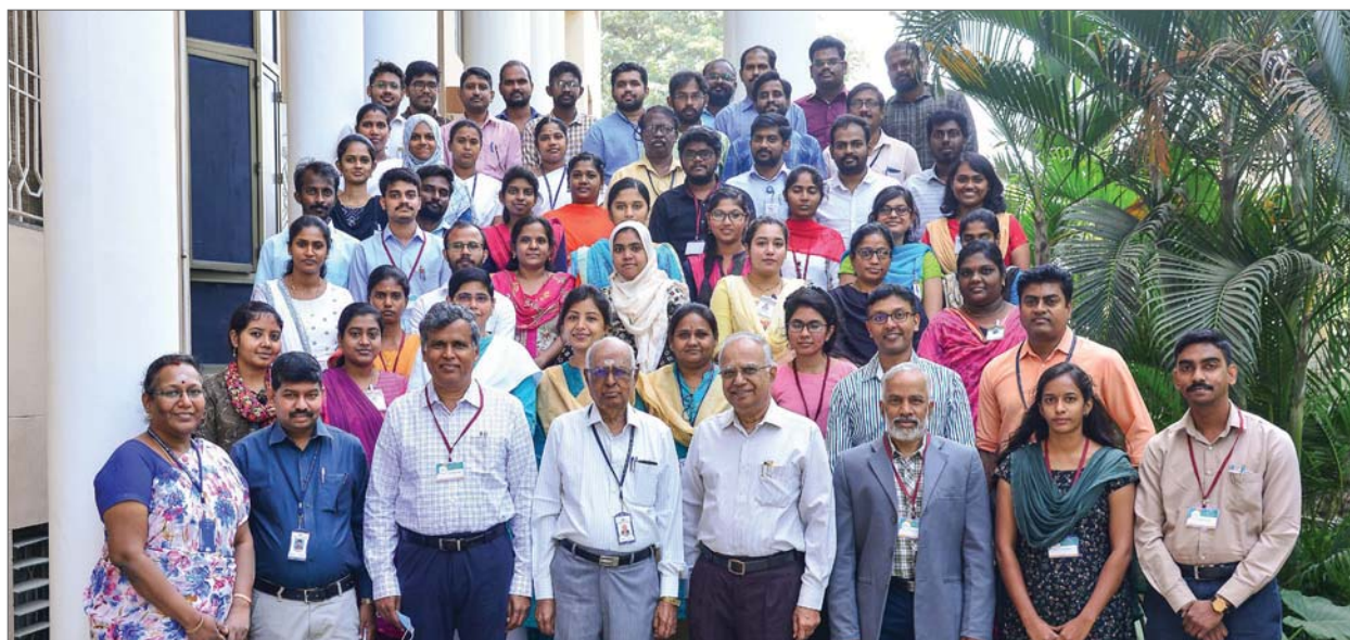
Participants of the International workshop on data science and modern biology