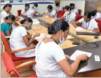
Quiz for AOP, Aravind - Madurai