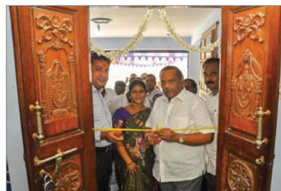
Manalurpettai (March 30, 2022)