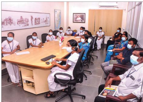
Participants at the CME on Patient safety goals