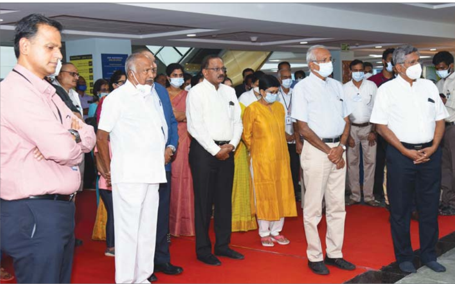
Aravind team and guests at the inauguration of the out-patient services in the second floor of Aravind-Chennai

With the patient numbers growing year after year, it became imperative for Aravind-Tirunelveli to relocate its out-patient services and operation theatres to a new building. Construction of this new facility is underway and is expected to finish by October 2022. Along with this, housing facility for the staff is also coming up in the same premises. Similarly at Aravind-Coimbatore, the regulatory authorities have finally given approval for the new building and construction work has begun.