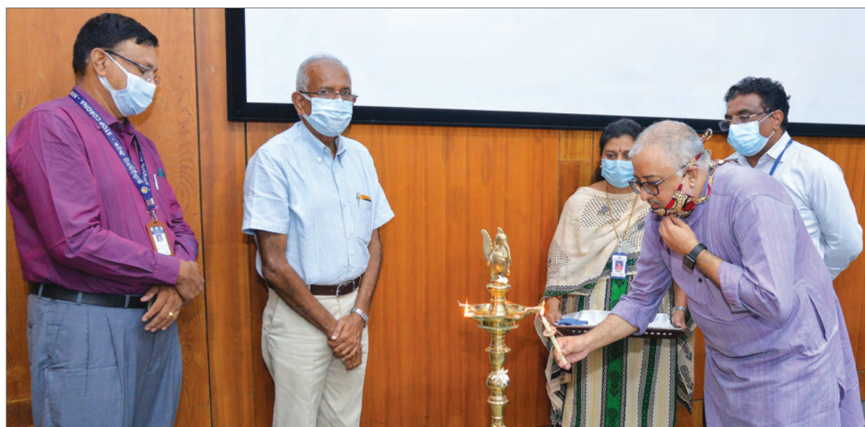
At the inauguration of the training programme for District Programme Officers and government ophthalmic assistants

Another important initiative anchored by the research division towards building the research culture at LAICO is the weekly Journal Club. Alongside the participation of Aravind employees, the journal club is attended by national and international participants from LAICO's partnering institutions. Fifty two articles were presented based on clinical, epidemiological and health services research studies, of which 12 were presented by the members of partnering institutions and the remaining by Aravind staff. Ten health services research projects are currently anchored by LAICO.