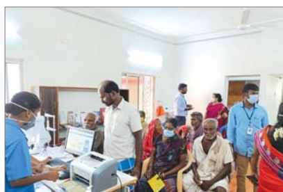
Sayalkudi (March 31, 2022)