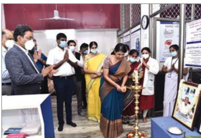
Puzhal (July 22, 2021)