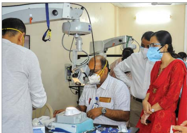
Hands - on training at MIGS symposium