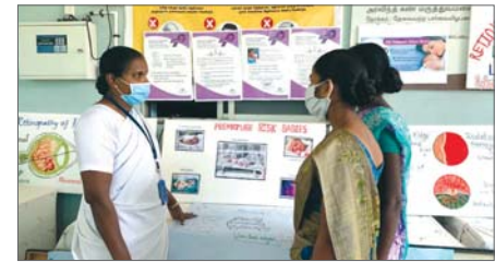
Awareness exhibition on RoP on the occasion of World Prematurity Day at Aravind-Theni