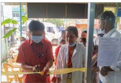
Pochampalli (March 30, 2022)