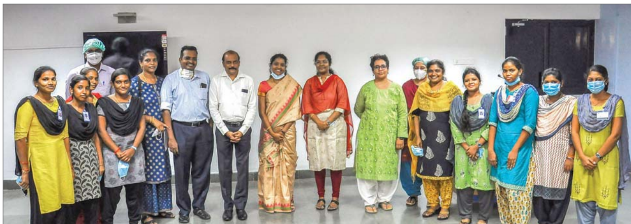
Participants at the workshop on current GCP, ICMR, new drugs and clinical trial rules

Aravind Centre for Eye Care Innovations organised two hackathons, to motivate staff to come up with innovative ideas to enhance the quality of eye care delivery. The first event held on June 12 had 16 teams comprising ophthalmic technicians, ophthalmologists