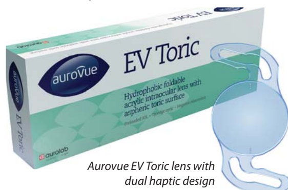
Aurovue EV Toric lens with dual haptic design

Aurolab recently launched the Aurovue EV Toric with a new dual haptic design manufactured from highly bio-compatible hydrophobic material. This is different from other lens materials, because of its optimum tackiness that helps bind the IOL to the capsule for better rotational stability.