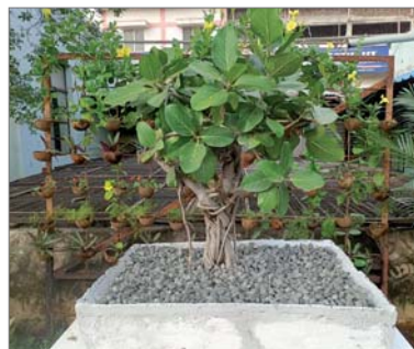
Glimpses from garden fest