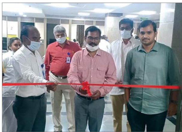
Inauguration of 'Aarogyasri' at Aravind-Tirupati

At Aravind-Tirupati, Aarogyasri, Andhra Pradesh Chief Minister's free health care scheme was inaugurated on April 1. An exclusive Cornea Clinic was inaugurated on July 21.