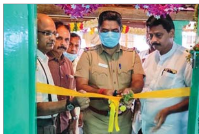
Senthamangalam (October 29, 2021)