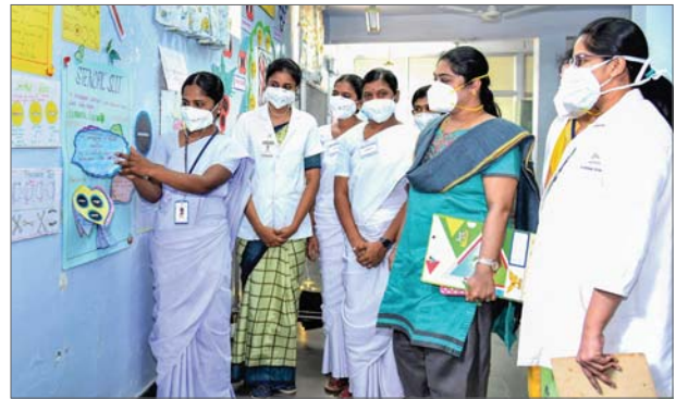
Refraction skill workshop

Aravind-Coimbatore conducted the CME for its entire staff involved in patient care delivery. Various aspects of patient care delivery such as ensuring quality, importance of effective communication professional ethics and continuous improvement.