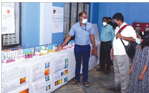
Awareness exhibition on RoP at Aravind-Coimbatore

Aravind-Coimbatore also received a grant from Seva Foundation to test ROP telescreening using low cost cameras employing artificial intelligence. Clinical images taken using different cameras are being compared.