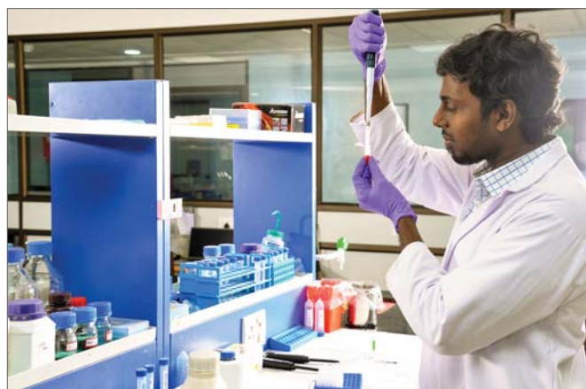
Confirmation of protein transfer in Western blot experiment

The primary focus in diabetic retinopathy (DR) research is to identify and validate prognostic biomarkers that can predict either the onset or the progression of the disease. A comprehensive mass