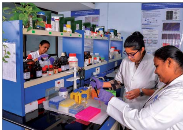
Pharmacology team assessing the efficiency of hsa-miRNA 483-3p transfection in primary human trabecular meshwork cells