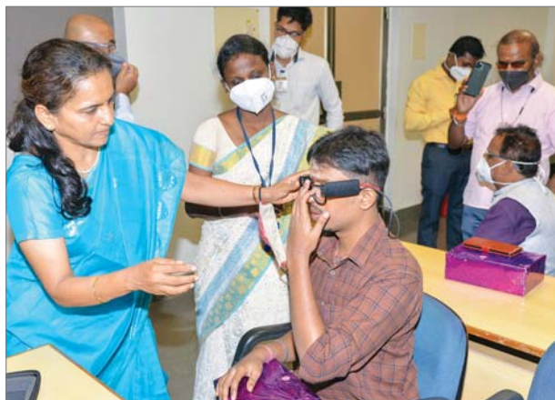
Patient with low vision trying out the smart vision spectacles

first indigenous product of its kind in the country at a function organised at LAICO on August 16. Five visually impaired persons received the smart vision spectacles free of cost at the function.