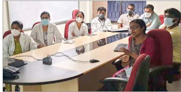
Doctors of Aravind - Tirupati attending ReLOAD