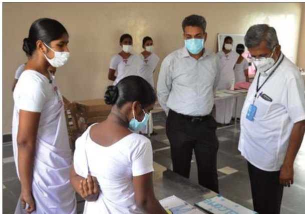
Department-wise exhibitions by AOP at Aravind - Pondicherry ...

To evaluate AOP's competency level and to give them an opportunity to brush up their knowledge and get updated, an examination was conducted at Aravind-Madurai on November 26. A total of 415 MLOPs took the examination and from this, the best 30 performers were selected for the final quiz competition. The participants took part in teams and the winning teams were awarded.