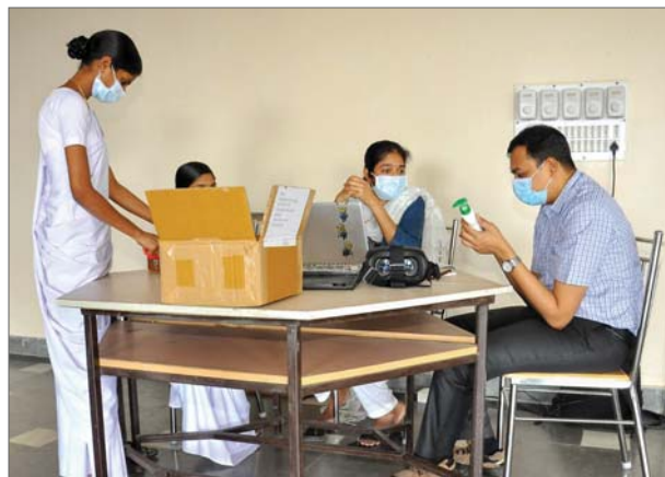
Participants at Hackathon 3.0

The CME aimed to orient the participants on the importance of giving individual attention to patients; confirming patient identity at every stage of care, importance of listening and proper communication skills. Trainees from the departments – Medical Records, Refraction, Out-patient, Lab, Counselling, Ward, Operation theatre and Opticals – depicted challenging situations they face at work in the form of role plays. The analysis that followed the presentation