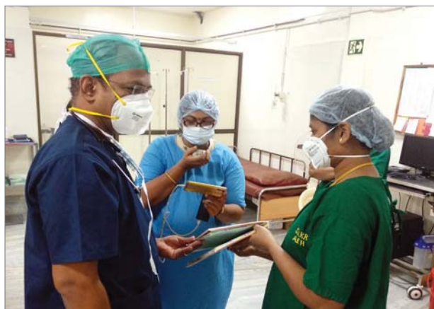
Virtual audit of NABH standards at Aravind-Madurai

Training for paramedics are being organised regularly to orient them on the NABH standards and to implement these in their respective departments.