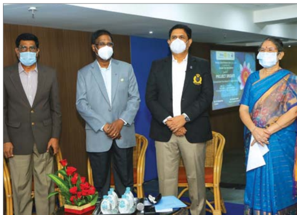
At the launch of project Drishti

At Aravind-Chennai, Rotary Club of Madras East launched “Project Drishti” on September 17, to donate Smart Vision spectacles to 300 eligible beneficiaries. At the launch, a total of 17 visually impaired persons received Smart Vision spectacles free of cost. Aravind-Madurai in collaboration with the NGOs, Vision Aid and Trees for Life has embarked on a project to distribute smartphones to visually impaired students and job-seekers from underprivileged communities. The smartphone will be beneficial for students to undergo online classes and for job-seekers, it will help in better networking and easy correspondences to find a placement. At a function held at Aravind-Madurai on January 4, smartphones were distributed to ten deserving visually impaired persons. These beneficiaries were trained on the efficient use of smartphone using