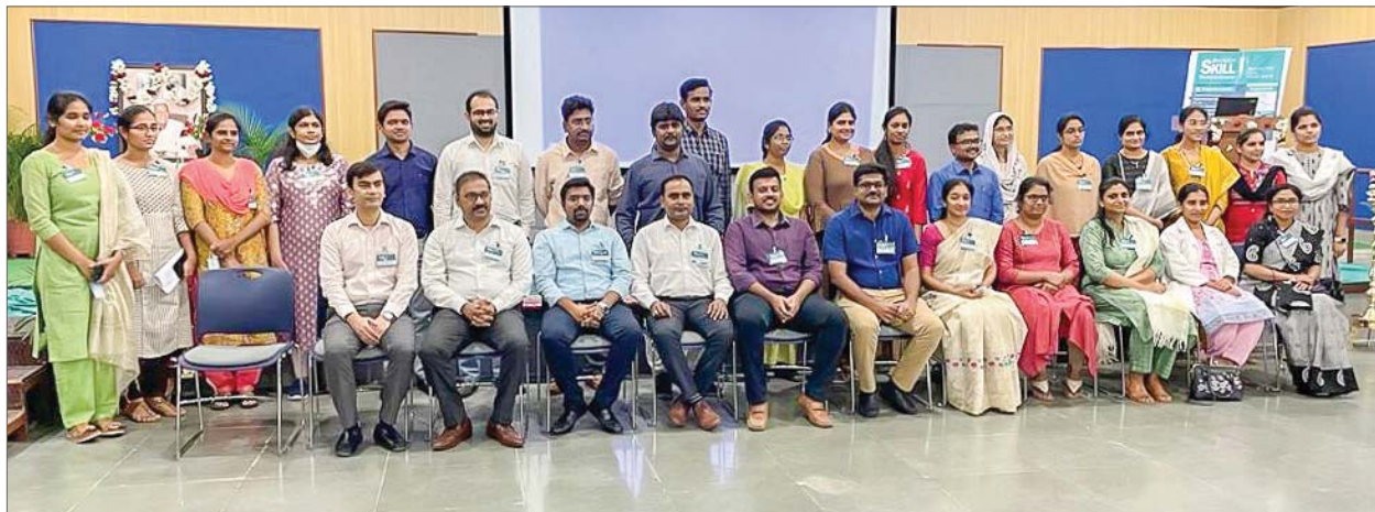
Inauguration of Diagnostic skills transfer course

SV Aravind Eye Hospital, Tirupati organised the course in association with Andhra Pradesh Ophthalmic Society and Tirupati Ophthalmic Society. A total of 85 people took part. Stations were set up to facilitate hands-on training on various diagnostic tests. A quiz was also conducted in which the participants enthusiastically took part.