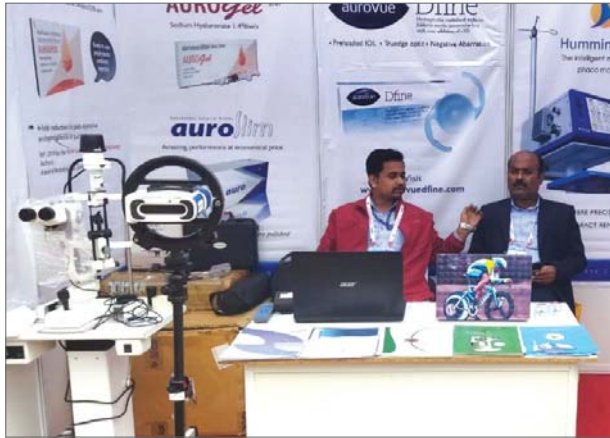
Aurolab stall at the Bihar Ophthalmological Society Conference, Muzaffarpur

Aurolab participated in 12th Annual conference of Association of Community Ophthalmologists of India held in Kolkata on August 21 and introduced its products to the delegates.