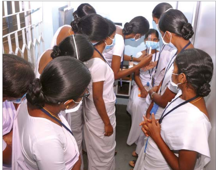
Training programme for technicians of vision centres at Aravind-Tirunelveli

During April 2021 to March 2022, four community eye clinics and two city centres together handled 179,068 patient visits.