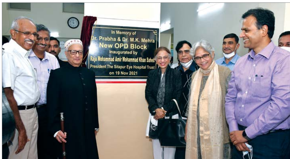
Aravind team at Sitapur Eye Hospital during the launch of UP-SIGHT

(iv) Innovation: This work-stream is focused on improving case detection at vision centres for conditions such as for diabetic retinopathy, age-related macular degeneration and glaucoma.