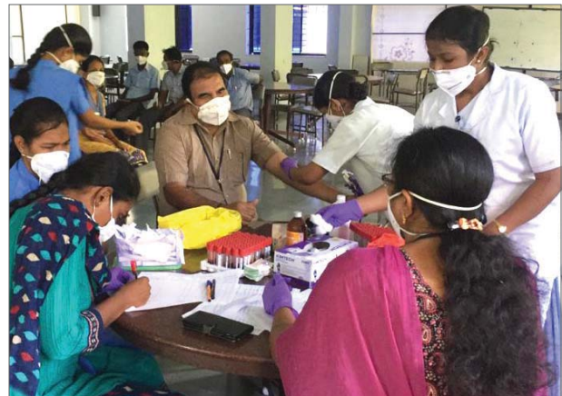
Antigen test for staff at Aurolab

Aurolab team and share their feedback on the product. A total of 718 doctors thus registered and 18,753 units of Aurovue were booked after the campaign.