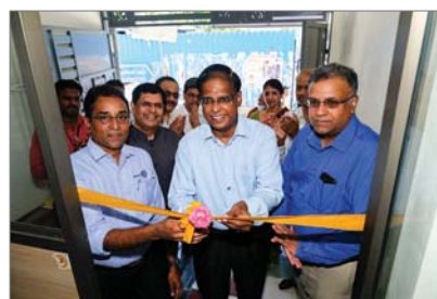
Korukkupettai (March 31, 2022)