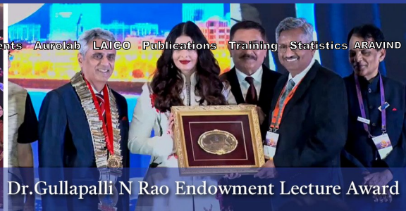
Dr. Gullapalli N Rao Endowment Lecture Award