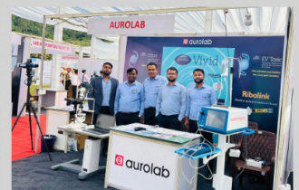
UTTAR EYECON 2023