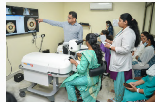
Hands-on training during the workshop