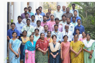
Participants of the workshop