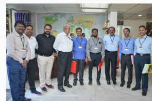
Faculty at the Symposium on Diabetic Retinopathy