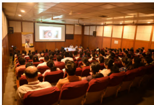
Participants at the Phacoexcel workshop