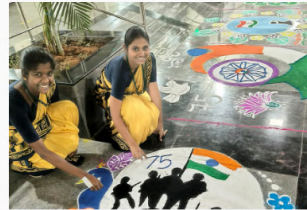
MLOPs engaging in creation of Rangoli

Aurosamabaralu is a monthly event at Aravind-Tirupati designed to bring out the talents of staff members and foster unity among departments. This year's Aurosamabaralu commenced with a Rangoli competition themed around Republic Day, enthusiastically participated in by MLOPs and administrative staff. A patient's attendant served as the judge, evaluating the colourful Rangoli creations.