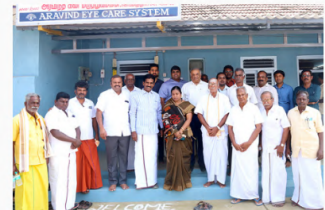
Community members at the inaugural event