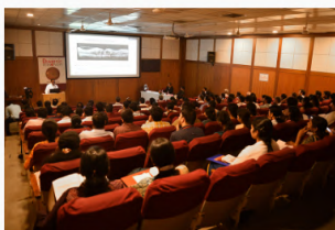
Participants attentively listening during the session