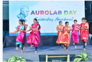
Staff members performing a dance programme