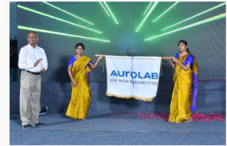
Launch of the logo