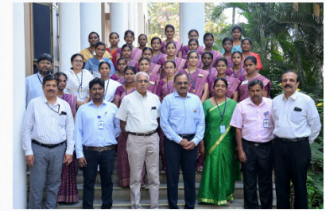
Store team representatives from all Aravind centres