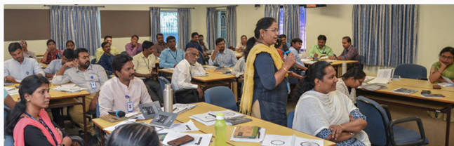
Participants at the workshop on the Seven Habits of Highly Effective People