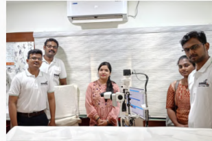
Aurolab’s Domestic Marketing team showcasing their products at the 5 th Winter IIRSI 2024 conference