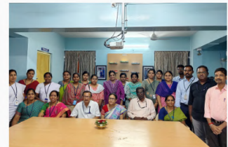
Attendees at the Personnel Meet