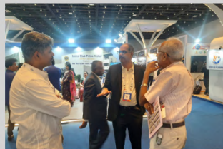
Engaging in discussions with the delegate