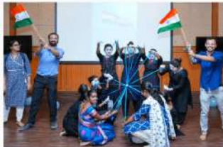
An engaging mime show