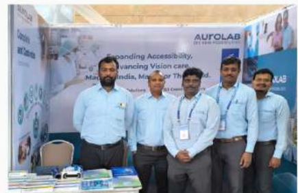
Aurolab team showcasing their products at the conference

At these events, Aurolab showcased a comprehensive range of advanced ophthalmic technologies, attracting significant interest from attendees. Their participation reflects Aurolab's unwavering commitment to advancing ophthalmic care through innovation and fostering collaborative engagement with platforms such as BOSCON, Phaco Refractive Decoded, and EYECON.