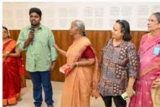
A beneficiary sharing his feedback on how training and rehab measures have impacted his life