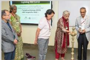
Ceremonial lamp lighting during the two-day consultation programme