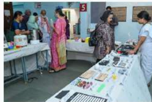
An exhibition showcasing various low vision devices and their functions