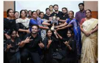
The Green Team triumphing with the Auroutsav Rolling Trophy