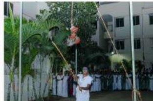
An MLOP skillfully smashing the earthen pot during the Uriyadi game