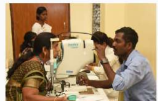
On-site fundus photography conducted for school teachers and parents