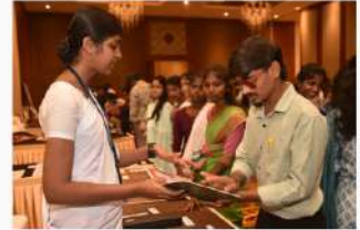
Signature and fingerprint campaign in progress