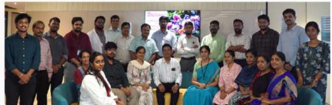
Participants of the Advanced Cataract Course for External Ophthalmologists