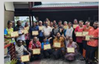
Participants of the Ophthalmic Instruments Maintenance Training Course

The trainees were provided with toolkits, cleaning supplies, lubricating materials, a Handbook on Instruments and Equipment Maintenance, and a DVD on Ophthalmic Instruments Maintenance, a step-by-step video guide illustrating care and maintenance procedures.