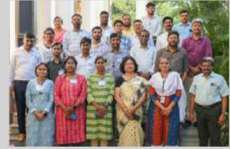
Participants of the Customised Training in Eye Health Advocacy & Community Mobilisation Training