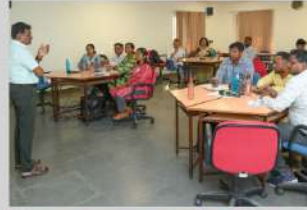
An engaging classroom session during the training programme

By the end of the training, participants had developed outreach strategies for their respective organisations, which they will implement upon returning to their locations.