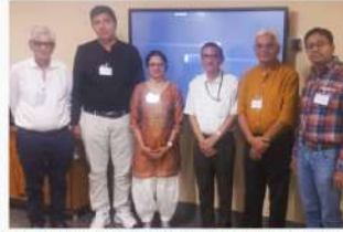
The leadership team from Rotary Navsari Gujarat at Aravind-Theni

A leadership team from Rotary Navsari Gujarat visited Aravind Eye Hospitals in Madurai and Theni to engage in discussions with senior leadership members and gain exposure to Aravind's practices.