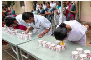
MLOPs enjoying fun-filled sports events