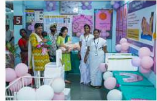
Visitors learning about the challenges and impact of preterm birth