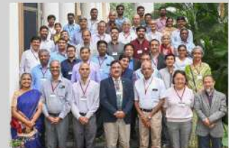
Participants of the Consultation on Enhancing Effective Cataract Surgery and Refractive Error Coverage towards Achieving eCSC & eREC Targets for 2030