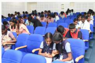
Quiz contestants participating in a preliminary written examination