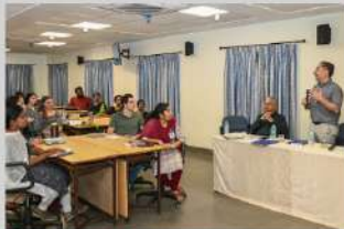
A scientific session at the conference

During the morning sessions, ten students from Dartmouth College presented research proposals on various eye diseases to an audience group of clinicians, scientists, and research scholars. In the afternoon, AMRF research scholars displayed their research activities through poster presentations. During lab visits, AMRF scientists showcased the core research facilities and explained the ongoing projects to the Dartmouth delegation. Additionally, there were cultural events, performed by students from both institutions. The conference served as a unique opportunity for both institutions to share educational and research activities, paving the way for future collaborative research projects and long-term partnerships.