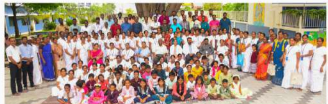
Participants of the PASS event