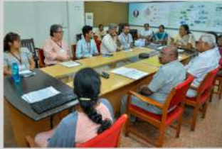
Participants at the eye care monitoring meeting

By the end of the course, participants developed outreach strategies for their respective hospitals, which they would implement upon returning to their countries.