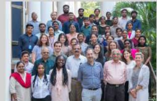
Participants of the AMRF – Dartmouth Education and Research Conference