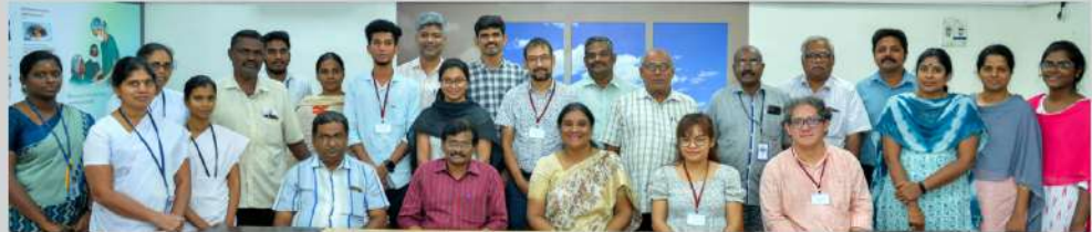
Participants of the Certificate Course on Community Outreach and Social Marketing of Eye Care Services