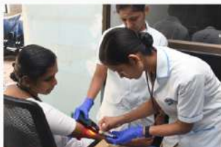
Blood test being conducted for the MLOPs