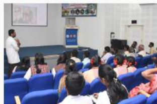
School children enthusiastically taking part in the main multimedia quiz event