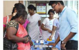
An orientation on mobility devices