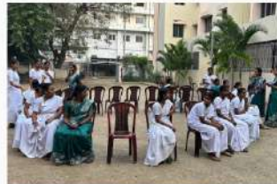
An exciting game of musical chairs for MLOPs