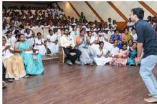
A staff member showcasing a dance performance for the audience