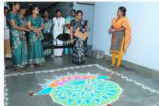
A mesmerising rangoli created by a contestant