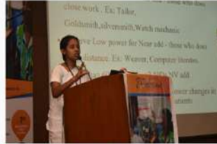
An MLOP conducting a session