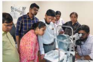
Participants fully engaging in the Wet lab session