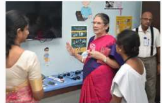
Exploring low vision aids at the exhibits