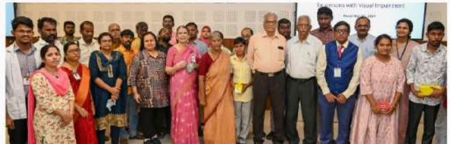
Beneficiaries of low vision devices with the Senior Leadership Team of Aravind